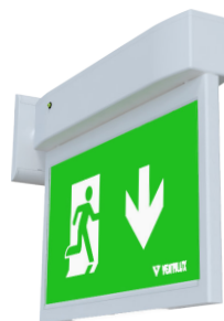
double sided side wall mounted (Bracket available separately)