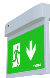
double sided ceiling mounted

*Equipment dimensions may vary with different systems.