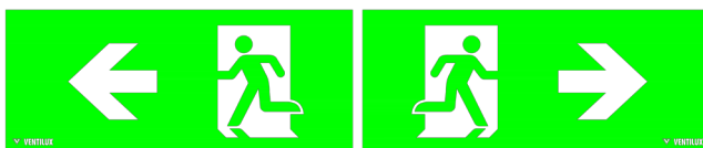
Left /Right Arrow (Left one side, Right opposite side) PN: LPVGDISO013VL