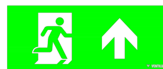
Up Arrow (both sides) PN: LPVGDISO04VL

Additional options of Printed Panels available. Contact Ventilux for further details.