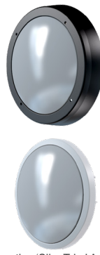
Alternative 'Slim Trim' Available