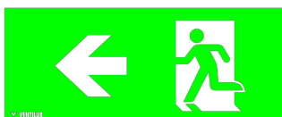
Left Arrow PN: 01710