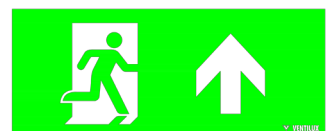
Up Arrow PN: 01775