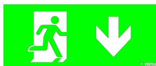
Down Arrow (both sides) PN: LPSTISO02MVL