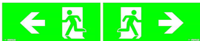
Left /Right Arrow (Left one side, Right opposite side) PN: LPSTISO13MVL